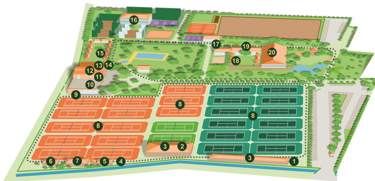
CAMPUS MAP - English